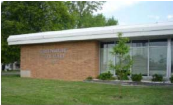
Adaptive reuse – Elementary School into Mayor’s Office and Courtrooms